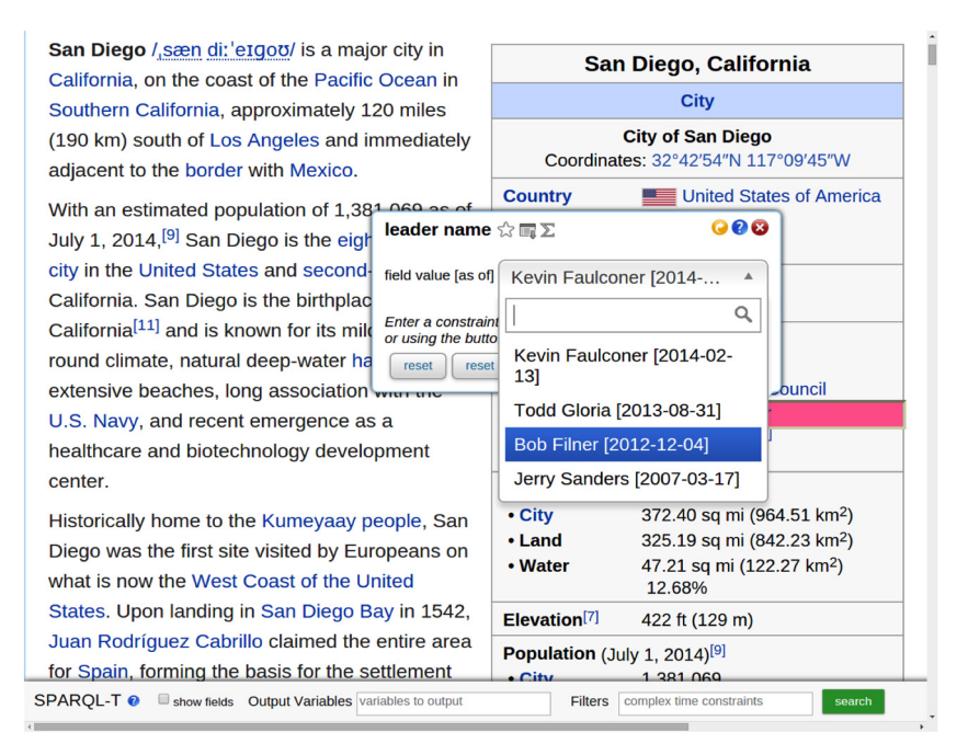
Fig. 4. The history of San Diego names is shown in the leader-name pull-down menu.

of-use to relational databases and is even more desirable here, since it shields the users from having to discover the internal names and organization of DBpedia. It is also quite powerful, since it supports the specification of queries involving joins and aggregates. Moreover, the user can still enter text conditions in the standard search box of Wikipedia to find the pages that satisfy both the structured query and the standard keyword based retrieval made popular by web search engines. Our experiments show that this combination yields very powerful queries producing selective high-precision answers [38].